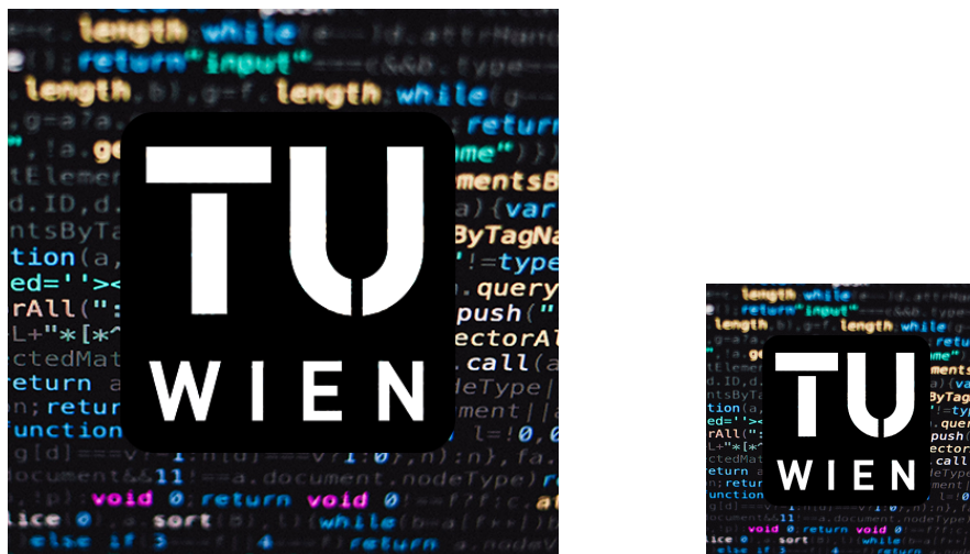
(a) The TU Wien Informatics logo at text width. (b) The TU Wien Informatics logo at half the text width.

An image is added to a document via the \includegraphics command as shown in Figure 3.1. The \subcaption command can be used to reference subfigures, such as Figure 3.1a and 3.1b.