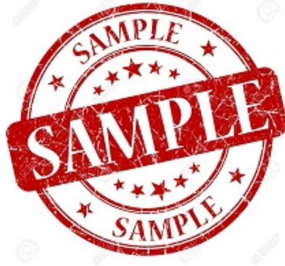
Figure 3-1: Sample Diagram 1

“References” tab and select “Figure” in the dropdown list. Click “Update Table” to update the List of Figures.