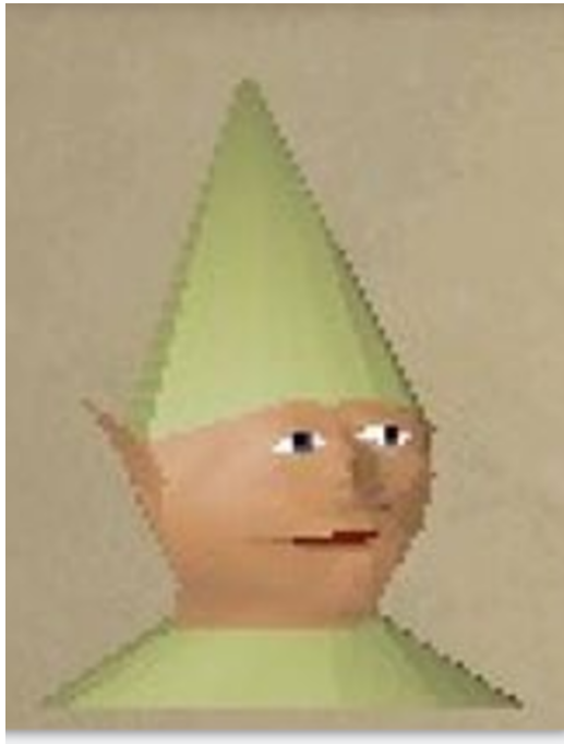
(a) A dank meme.

Which produces the output found in figs. E.1, E.1a, E.1b, E.1c and E.1d: