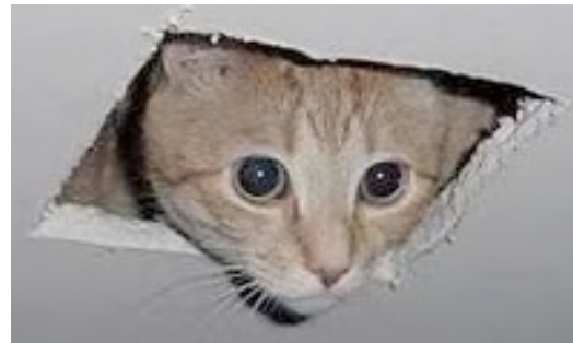
(b) Ceiling cat.